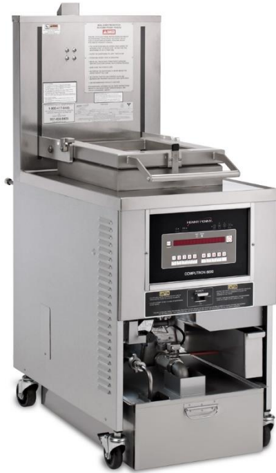
OFG 391 high volume gas open fryer

Henny Penny high volume open fryers offer tremendous throughput in a highly reliable frying platform with programmable operation, oil functions and fast, easy filtration.