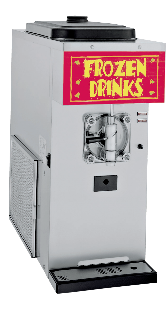
Shown with optional top air discharge chute