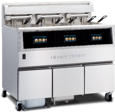
OFE 513 3-well open fryer

The Henny Penny F5 open fryer is designed from the ground up to make frying high-quality food easier, safer and more efficient for any kitchen.