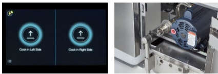
Full color touch and swipe control 8 gpm filter pump

Choose from 1, 2, 3, or 4-well, full or split vat configurations.