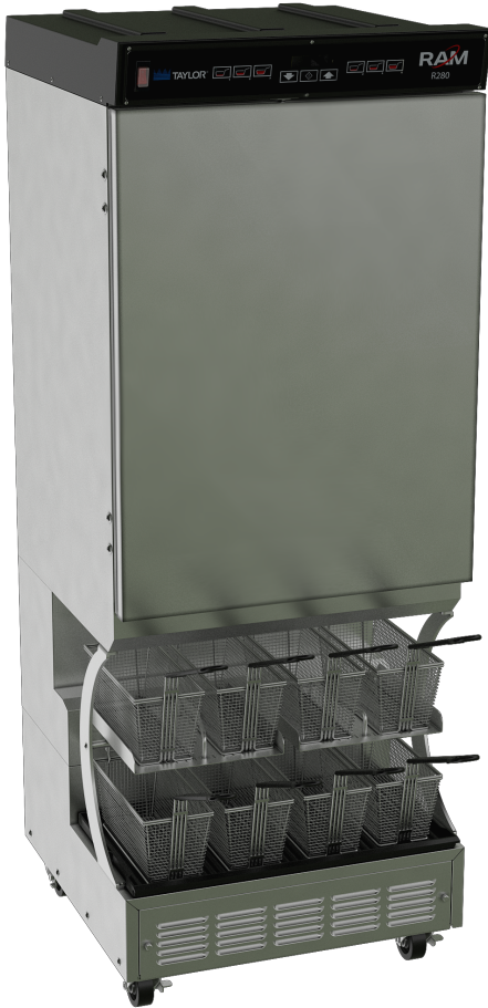
Fryer Baskets Sold Separately