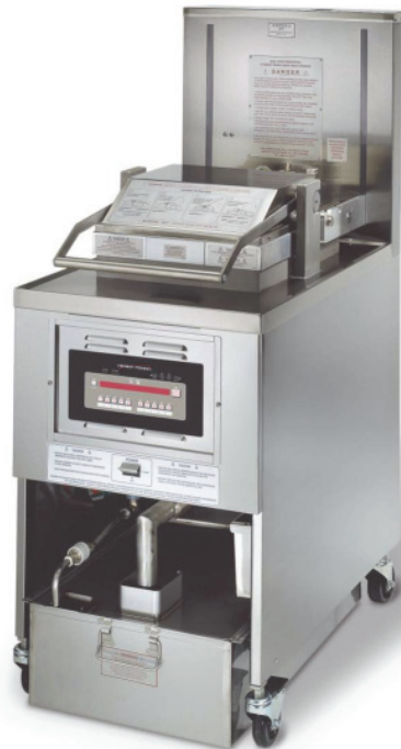
PFE 591 high volume electric pressure fryer

Henny Penny first introduced commercial pressure frying to the foodservice industry more than 50 years ago. Frying under pressure enables lower cooking temperatures for longer oil life and faster cooking times to meet peak demand. Pressure also seals in food's natural juices and reduces the amount of oil absorbed into product.