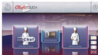
Chef'sTouch control: Just tap and swipe to run automated cooking and operating apps

Henny Penny FlexFusion combi ovens combine different cooking methods into one piece of equipment with the flexibility to cook nearly everything on your menu to perfection.