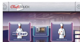
Chef's Touch control: Just tap and swipe to run built-in apps

What really sets FlexFusion apart is its ease of use. The Platinum Series features Chef'sTouch, an intuitive control system with a durable 7-inch touch/swipe screen that makes cooking with FlexFusion as