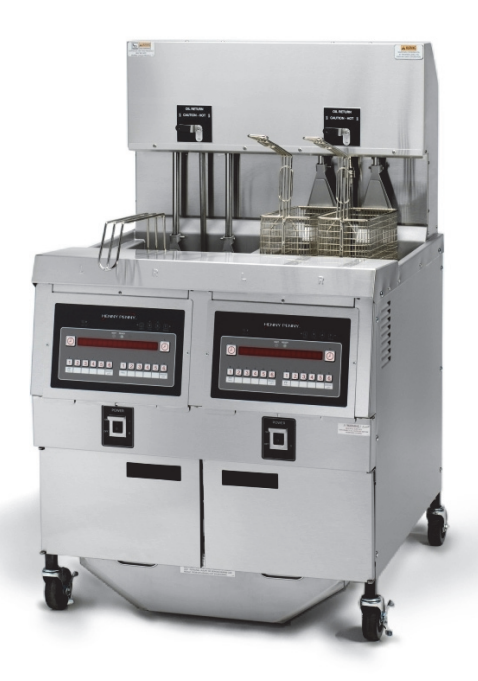
OGA 322 2-well gas auto lift open fryer

Henny Penny open fryers offer high-volume, integral multi-well frying with programmable operation, oil management functions and fast, easy filtration.