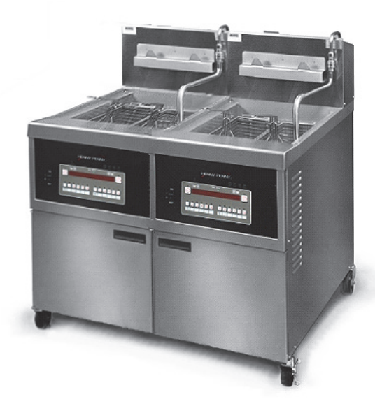
OFG 342 2-well large capacity gas open fryer with Computron <sup>™</sup> 8000 control

Henny Penny open fryers offer high-volume frying with programmable operation, oil management functions and fast, easy filtration.