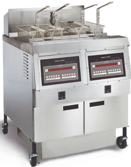
OFG 322 2-well gas open fryer with Computron™ 8000 control

OFG 321 1-well gas OFG 322 2-well gas OFG 323 3-well gas