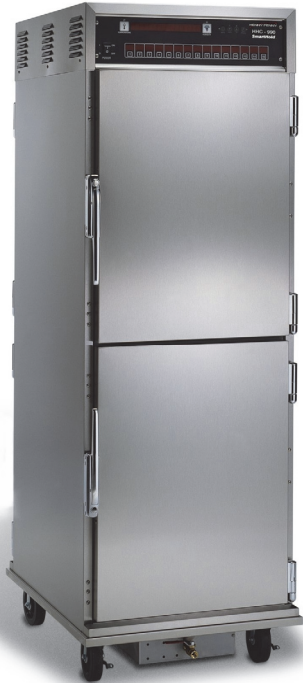
HHC 990 SmartHold full-size heated holding cabinet with automatic humidity control

Henny Penny SmartHold humidified holding cabinets create and maintain ideal conditions for holding a wide variety of hot foods over extended periods of time prior to serving.