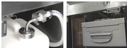
Oil replenished automatically from JIB for multi-well (left) or reservoir for 1-well (right)

Henny Penny Evolution Elite® open fryers use innovative filtering and oil level technology to extend oil life, improve product quality and reduce overall oil consumption and costs. Here's how: