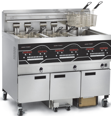
EEE 143 3-well open fryer