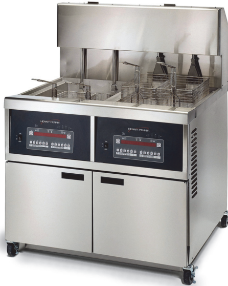
OGA 342 2-well large capacity auto lift gas open fryer

Henny Penny open fryers offer high-volume frying with programmable operation, oil management functions and fast, easy filtration.