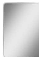
Also accepts 1 sheet pan