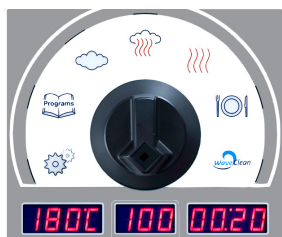
Gold Series mode selector with large digital display