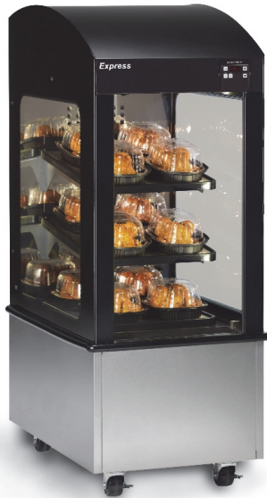
EPC 200 express profit center 2-ft unit on standard casters

Henny Penny express profit centers present an excellent solution for retailers seeking to expand hot food impulse sales and cross-merchandising opportunities.