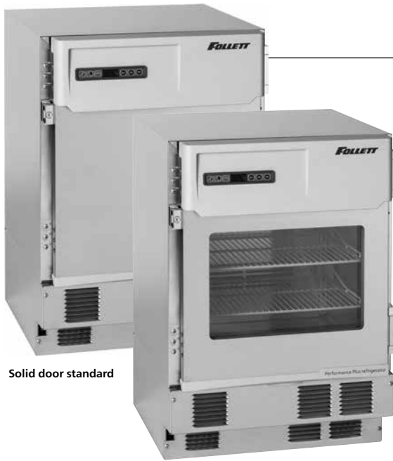
Solid door standard