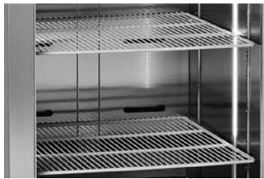
Heavy-duty epoxy coated shelves on LB models