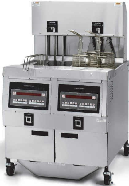
OGA 322 2-well gas auto lift open fryer

OGA 321 1-well gas OGA 322 2-well gas OGA 323 3-well gas