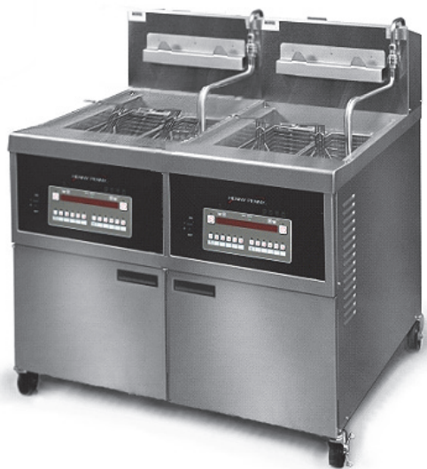
OFE 342 2-well large capacity electric open fryer with Computron™ 8000 control

OFE 341 1-well electric OFE 342 2-well electric