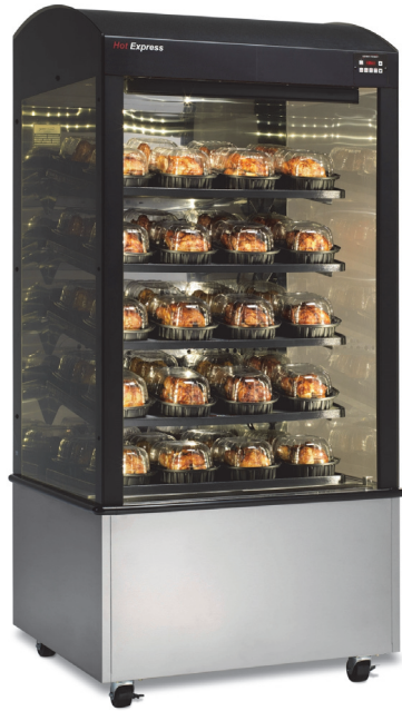
EPC 301 express profit center tall profile 3-ft unit on available casters

Henny Penny express profit centers present an excellent solution for retailers seeking to expand hot food impulse sales and cross-merchandising opportunities.